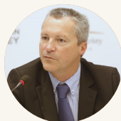
Cord Prinzhorn CEO Prinzhorn Holding

We are very excited to have found such an excellent location for this project. The paper mill we are setting up will further strengthen our supply of high-quality paper for our customers.